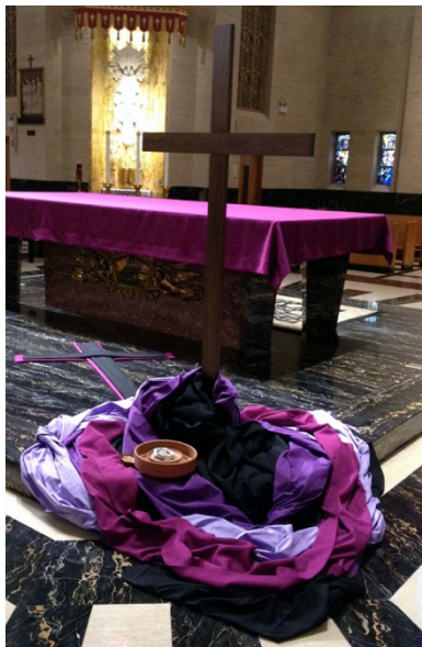
Lenten cross in the sanctuary at the National Shrine of St. Cabrini.