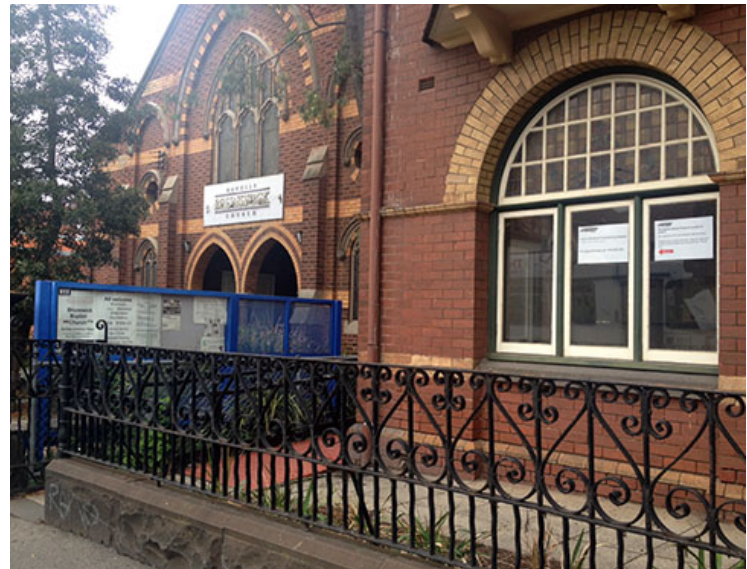
The exterior of the property (at 503 Sydney Road in the Melbourne suburb of Brunswick) where the Cabrini Asylum Seeker and Refugee Health Hub will be accommodated on the first floor.