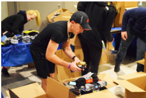
Photo above: Students lend a hand in boxing the thousands of socks donated for the Sox for 60 event.

Photo right: Each paper sock represents a donation made to purchase socks.