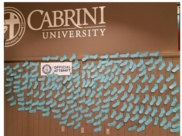
Photo right: Each paper sock represents a donation made to purchase socks.

To view a video of the day: https://www.instagram.com/p/BQjJK7pjXWn