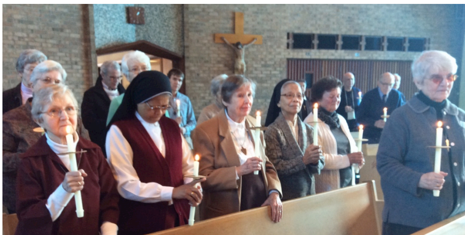
The women and men religious who participated in the Day of Prayer for Consecrated Life gathered with candles lighted in the chapel at Cabrini-on-Hudson.