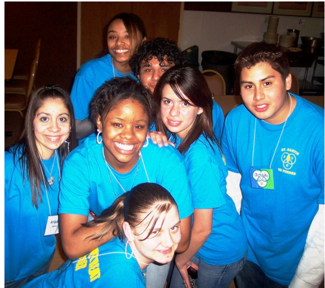
Some of the many young people who have partaken of a youth retreat held at the Cabrini Retreat Center.