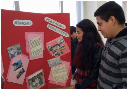
Visitors were able to view informative displays on the Cabrinian charism, religious life and the history of the West Park property.