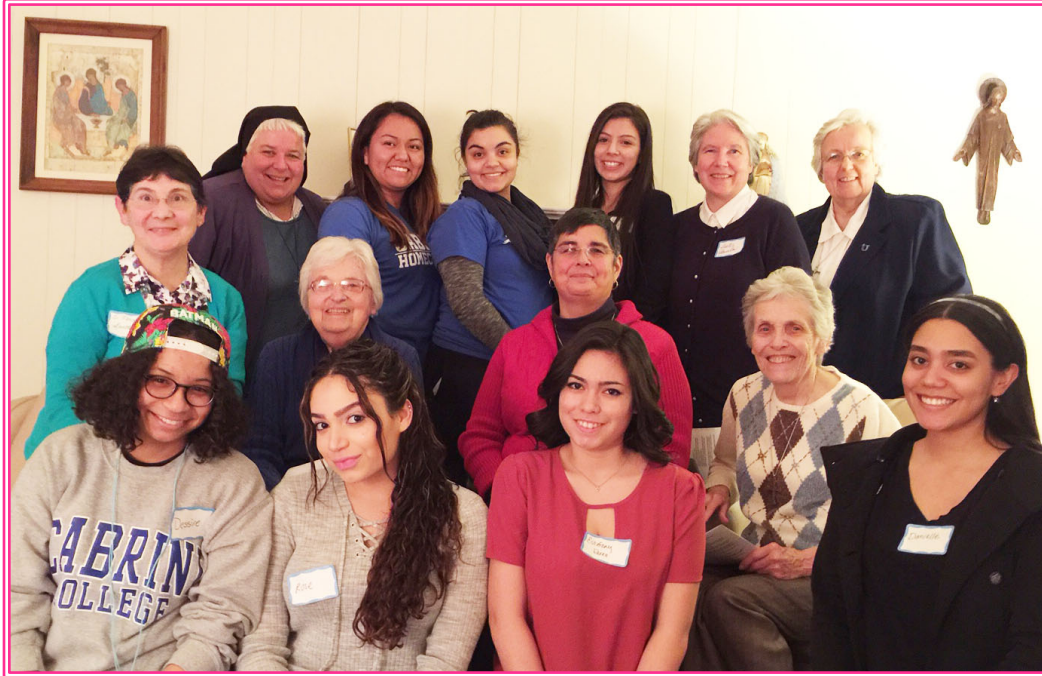
Sisters from six religious congregations enjoyed prayer, conversation, song and dinner with Latina students from Cabrini College and Immaculata University.