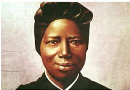
St. Josephine Bakhita