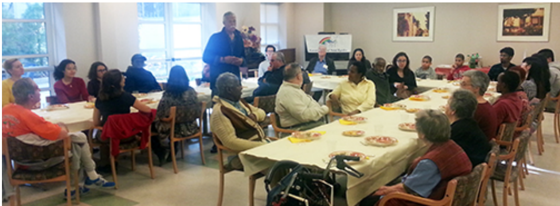
Pausing to give thanks before the Thanksgiving meal.