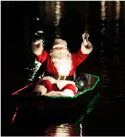
Santa arrives on his pirogue ready to mingle with the Cabrini High community.

Cabrini High School hosted its annual “Christmas on the Bayou” event Saturday, December 5 in front of Cabrini’s Moss Street Campus overlooking Bayou St. John.