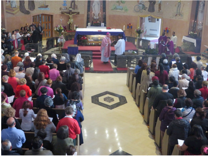
The Shrine was filled with worshippers at the bi-lingual Eucharistic Celebration.

The Shrine was packed for a bi-lingual Eucharistic Celebration. St. Elizabeth Church choir provided the music and the staff and volunteers of the Shrine contributed countless hours to prepare for the celebration.