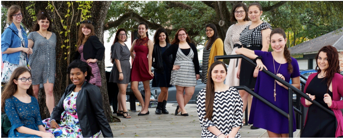
Cabrini High School students dress up for school as a fundraiser for Eden House, transitional housing for victims of human trafficking.

The Dresseember Foundation works in conjunction with the International Justice Mission, a human rights organization that rescues victims of slavery and sexual exploitation. An International movement, Dresseember originated in the fashion and creative industries to promote dignity and freedom for all women.