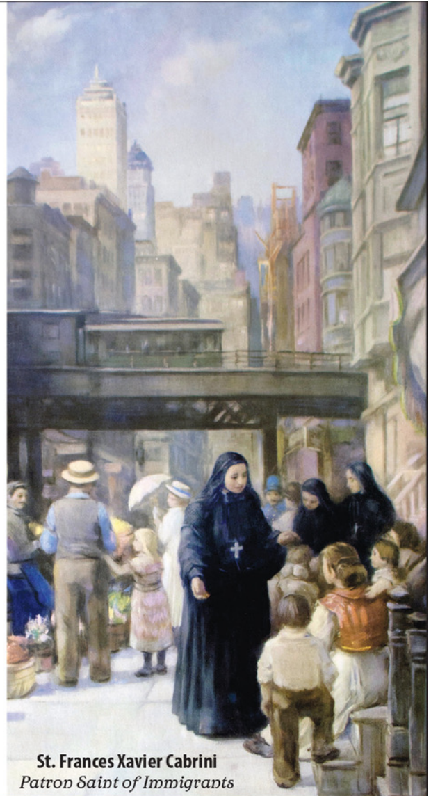
St. Frances Xavier Cabrini Patron Saint of Immigrants

701 Fort Washington Avenue New York, NY 10040 (212) 923-3536 CabriniShrineNYC.org