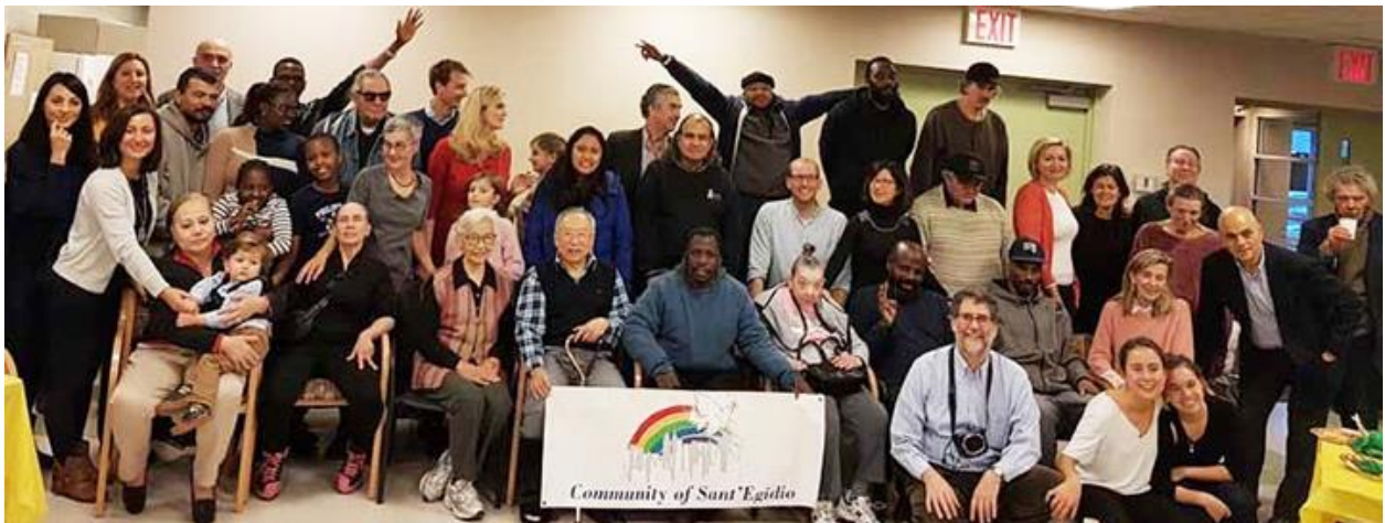
For the traditional celebration of Thanksgiving, volunteers from the Community of Sant'Egidio in New York gathered with many friends who live on the street. It was a large "table of brotherhood" without divisions or distance.