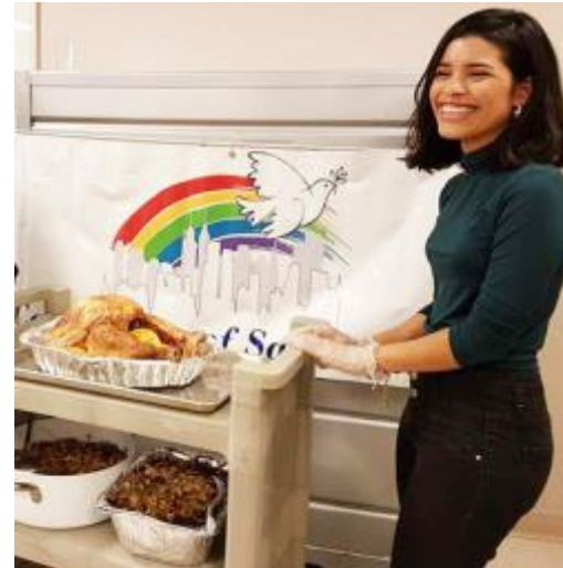
Turkeys with all the trimmings were prepared and served by volunteers of the Community of Sant'Egidio at the Cabrini Apartments.