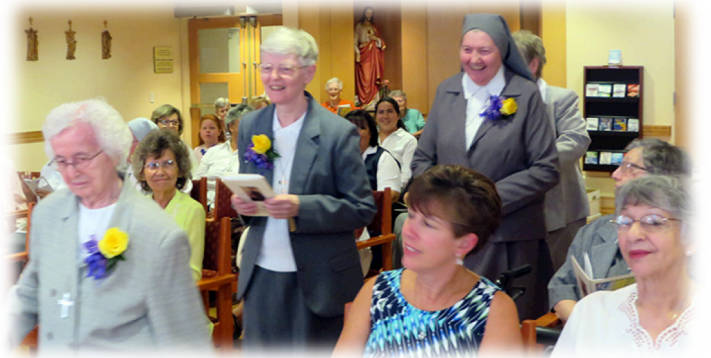
The Jubilarians process into the chapel.

On September 10, 2016, a celebration of thanksgiving was held at St. Cabrini Nursing Home in Dobbs Ferry, NY. Five Missionary Sisters of the Sacred Heart of Jesus joined to thank God for the call to consecrated life and the graces bestowed upon them over the years enabling them to faithfully respond to that call.