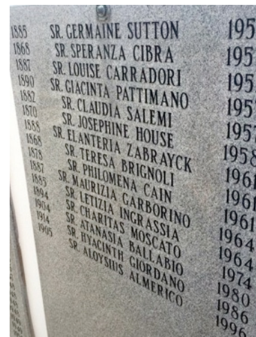
Photo below: At the mausoleum, the names of 44 Missionary Sisters are inscribed.