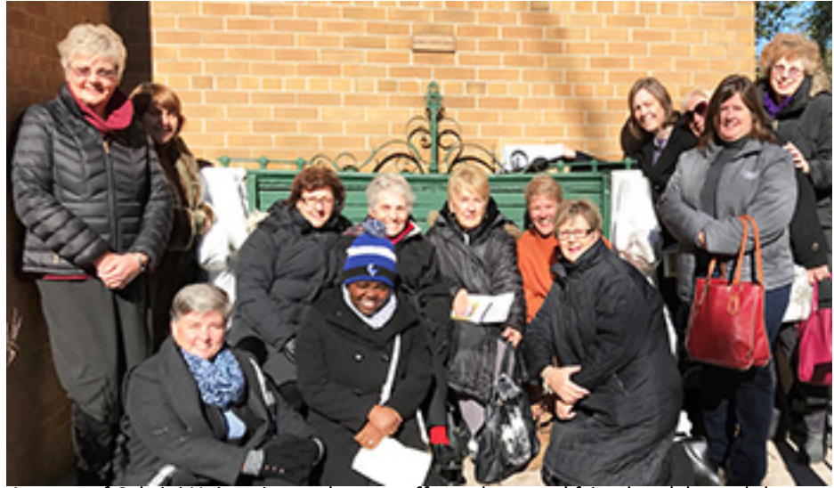
A group of Cabrini University students, staffers, alums and friends celebrated the Feast Day at the St. F.X. Cabrini Shrine in New York City followed by an uplifting visit with the Missionary Sisters at St. Cabrini Nursing Home in Dobbs Ferry.

After Mass, we walked to Fort Tryon Park to enjoy the beautiful view of the Hudson River and stretch our legs before the next stop. Then, it was off to Sam's Italian Restaurant in Dobbs Ferry, NY for a wonderful lunch. We shared stories about how Mother Cabrini had played a part in each of our lives.