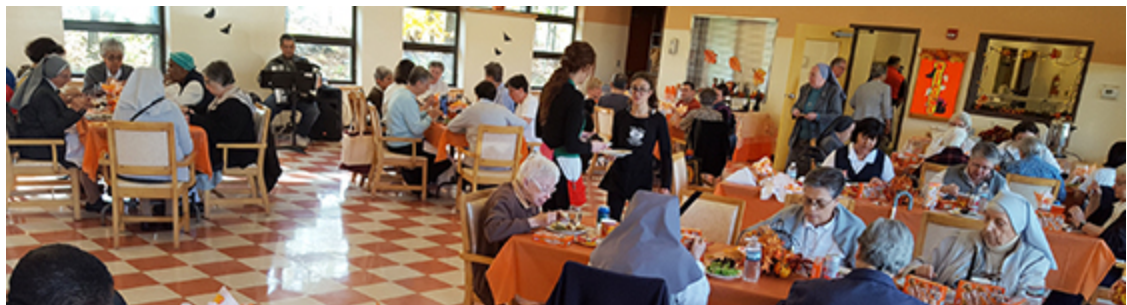
Following Mass, in the autumn themed dining room, the festivities commenced. The Missionary Sisters and their guests enjoyed a delicious luncheon and each other's company.