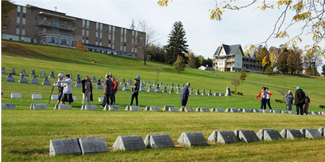
As the Mother Cabrini Feast Day nears, the Missionary Sisters spent time in West Park, NY visiting the graves of MSCs on whose shoulders we stand, sharing stories and memories.

On Saturday, October 28th, a large bus pulled onto our property in West Park, NY and many Missionary Sisters stepped out to recall and share memories of so many sisters who have gone before us but especially those who have died since 2015.