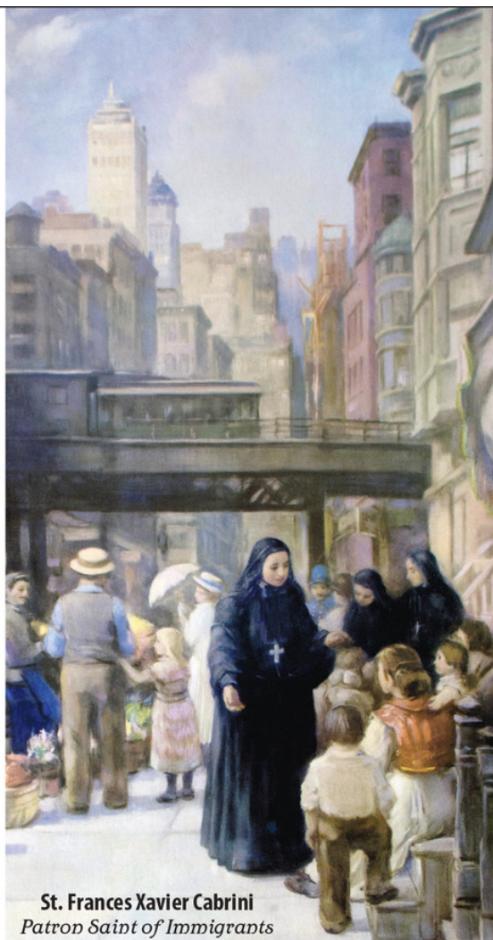
St. Frances Xavier Cabrini Patron Saint of Immigrants

701 Fort Washington Avenue New York, NY 10040 (212) 923-3536 CabriniShrineNYC.org