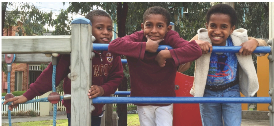
Judging from their smiles, these youngsters had a really fun time during the Cabrini Day out.

were awaiting, or recovering from, life changing surgeries and in most instances they had been separated from family for an extended time. The day was a fun distraction and they threw themselves into it.