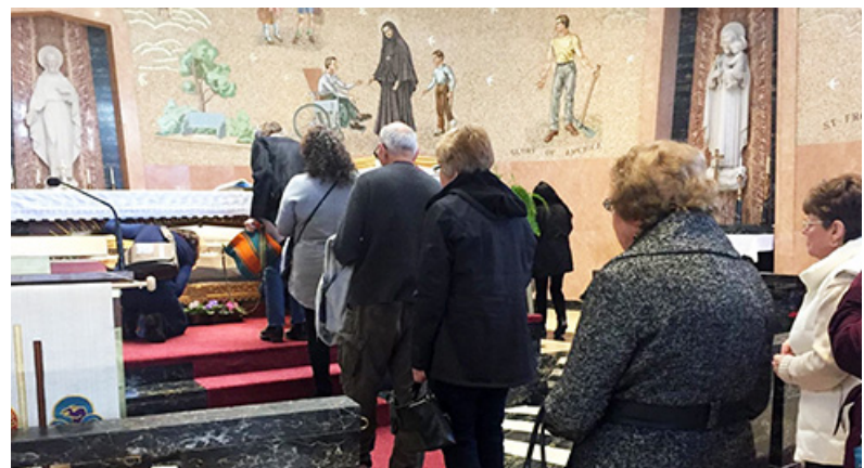
The St. Augustine pilgrims venerate the body of Mother Cabrini during their visit to the St. F.X. Cabrini Shrine.