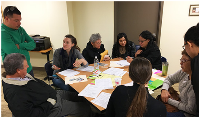
ICIRR workshop participants were able to obtain free legal aid from lawyers and law students, get assistance with citizenship applications and meet with consultants to determine eligibility to apply for citizenship at no cost.