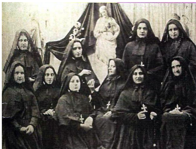
Mother Cabrini –seated center beneath the statue of the Sacred Heart – and Missionary Sisters. New York, June 1889. Mother Cabrini had arrived in New York on March 31 st of that year to begin her mission of ministering to the Italian immigrants in the US.