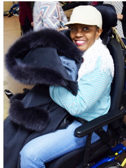
This young lady's face says it all – the winter coat drive at CIS-NYC brings warmth and joy to those in the local community.