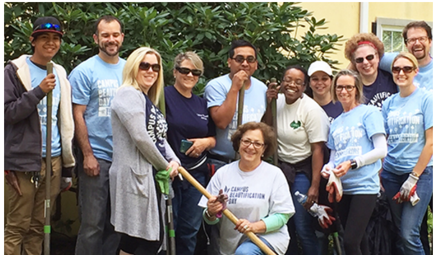
With rakes, trowels, shovels and great enthusiasm, faculty and staff fanned out across campus to dig, weed, and add a touch of fall color to campus buildings and common areas.