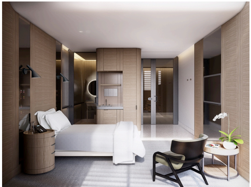
A design concept for a single patient room.