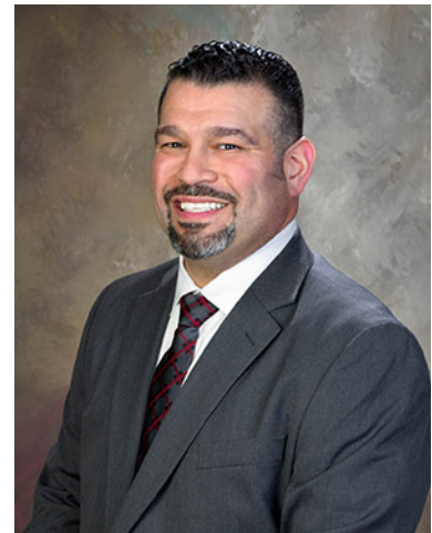
Commonwealth of PA Secretary of Education Pedro Rivera.

Rivera was nominated by Pennsylvania Governor Tom Wolf to serve as the Secretary of Education on January 20, 2015, and was confirmed by the state Senate in June 2015.