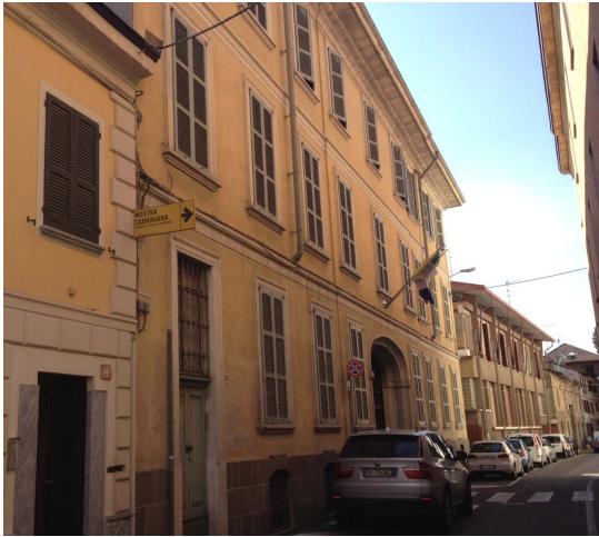
The entrance to the Cabrini convent in Codogno, Italy.

The town of Codogno, north of Milan, where St. Frances Xavier Cabrini established her congregation is a long way from Cabrini Health in Melbourne, Australia. Yet in September 2014, a group of eight staff from Melbourne travelled to the town and the Centro Di Spiritualita Madre Cabrini (Spirituality Centre) to connect with and foster within them the original Cabrini culture that resides there. Drawn from various departments across the organization, the pilgrims spent a week of discussion and exploration of the origins of the Cabrini culture and Mother Cabrini's birthplace.