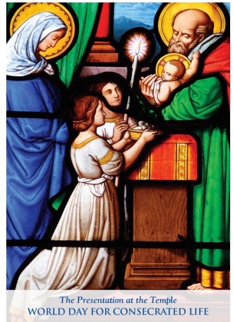
The Presentation at the Temple WORLD DAY FOR CONSECRATED LIFE

Throughout this past year religious congregations were encouraged by Pope Francis to “live the present with passion” and to “embrace the future with hope.” He also encouraged religious congregations to open wide their doors and invite the people to their communities to share the good news of the gospel and the joy of religious life.