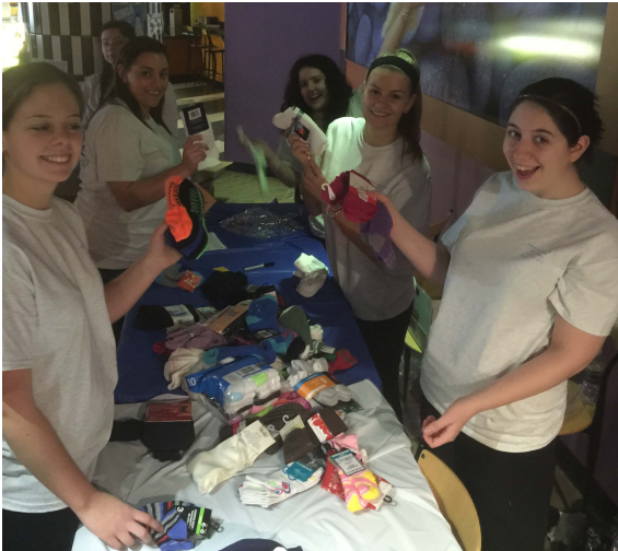
Cabrini College students lend a hand by sorting the donations of socks into those for men, women and children.