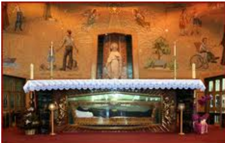
The altar at St. Frances Xavier Cabrini Shrine, New York City, in which the sacred remains of St. Cabrini are enshrined. The mural depicting her life serves as a majestic backdrop for the sanctuary.