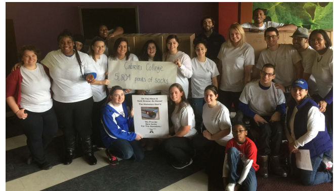
Job well done! The banner reads, "5,801 pairs of socks" sorted, packed and boxed for delivery to area shelters.

On a daily basis, donations of socks arrive at The Joy of Sox based in Radnor, PA from across the country. Schools, church groups, and corporations hold sock drives and ship all the socks that have been donated to Radnor. The socks, which can number in the thousands at any given time, need to be sorted, counted and boxed for delivery to area homeless shelters. The task is time-consuming and can be daunting without the help of willing volunteers.