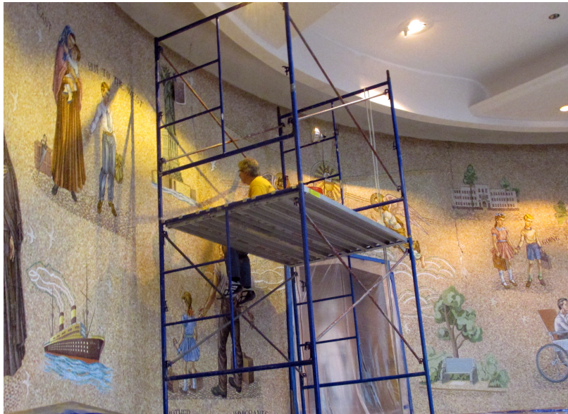
Skilled artisans are working to clean and repair the mural.

An extensive and historic mural restoration is underway at the St. Frances X. Cabrini Shrine in NYC