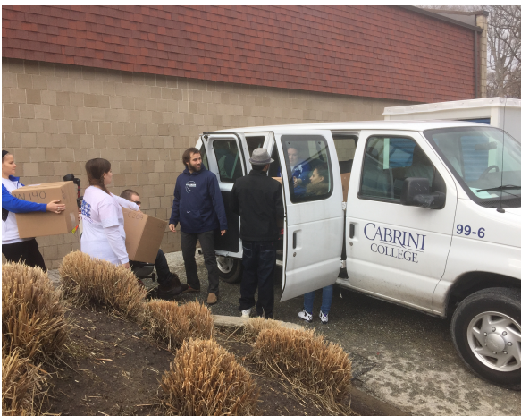
The boxed socks are loaded onto the vans, a step closer to delivery at area homeless shelters.

Enter the Cabrini students and CMC missionaries who quickly and efficiently processed thousands of socks and packed them neatly for delivery to area shelters where there is a constant demand for new socks. The generous volunteer spirit of the students and missionaries will help to ensure that for a while some of those who are homeless will have the comfort and joy of a new pair of socks.