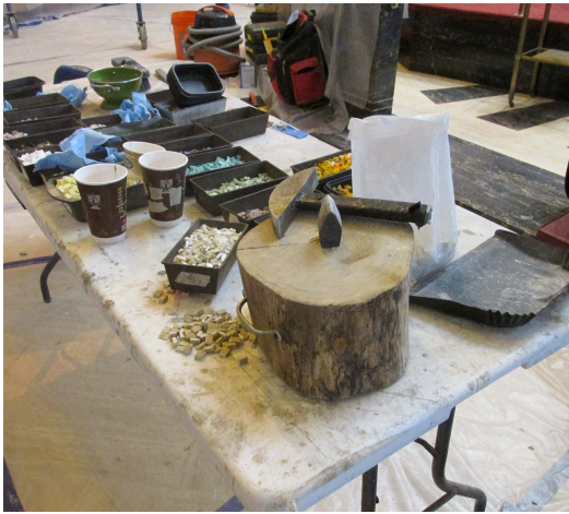
The tools of the trade are seen throughout the Shrine as the restoration unfolds.

3. Starting in Lent, we will be testing mid-day Masses at the Shrine on Tuesdays and Thursdays. If the idea "takes", we will continue with mid-day Masses during the week.