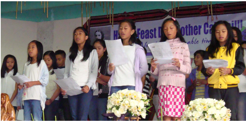
The students of SOSCFI sing in the chorus in celebration of Mother Cabrini's Feast Day.