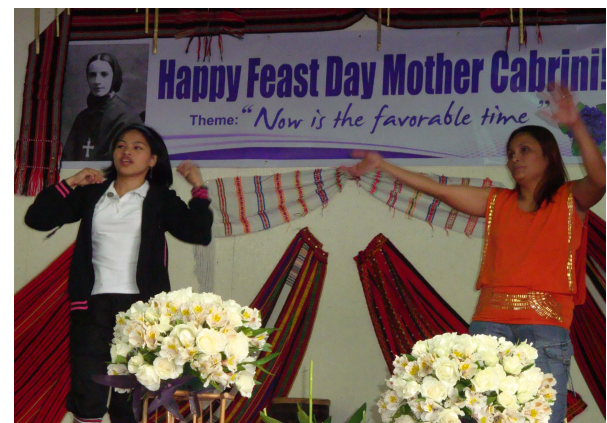
Variety show performers in honor of the Feast Day

After the liturgy all were invited to a grand celebration of the Feast Day in the church hall. A lively and musical variety show was performed by the students, volunteers, and staff of SOSCFI, followed by a delicious traditional luncheon. Words of congratulations were offered by the Trustees, Sister Romualda and other notable guests. Congratulations and gratitude were offered to all.